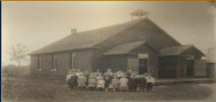
S.S. 1 – Silk’s – East Part Lot 5, Con 3 OS