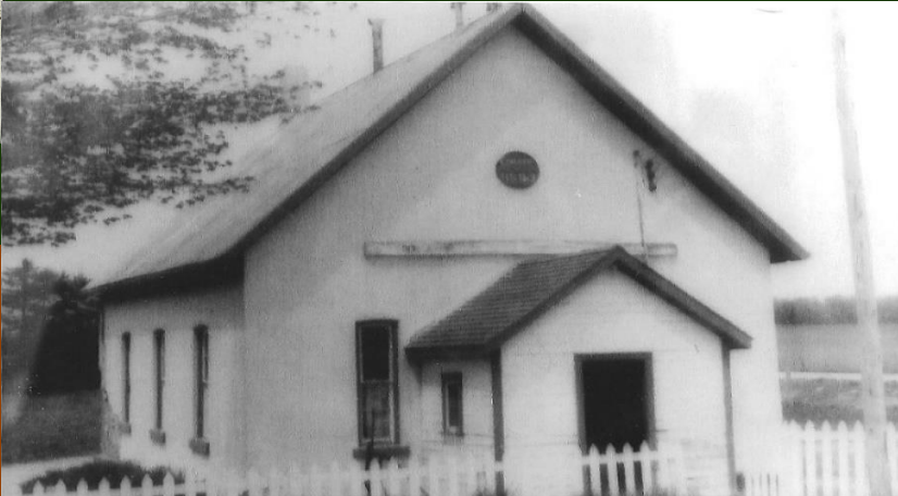
S.S. 3 – Conover – East Part Lot 20, Con 2 OS