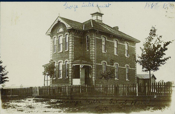
S.S. 2 – Horning’s Mills – East Pt Lot 14, Con 2 OS